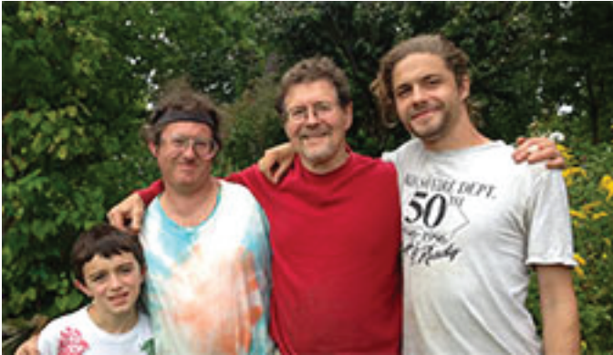
Some of our Creek Cleanup crew